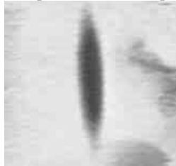
March 28, 1989, image from Soviet spacecraft, Phobos 2, as it was aligning itself with the Martian moon, Phobos. A Soviet mission goal was to explore the moon's surface with equipment. Image allegedly smuggled to public by Marina Popovich.

But on March 28, 1989, after the Soviet spacecraft had aligned itself with Phobos, the Tass news agency reported that: "Phobos 2 had failed to communicate with Earth, as scheduled, after completing an operation yesterday around the Martin moon Phobos. Scientists at mission control have been unable to establish radio contact." During the alignment, Phobos 2 transmitted an image of a long, thin shadow that seemed between the spacecraft and the planet Mars.