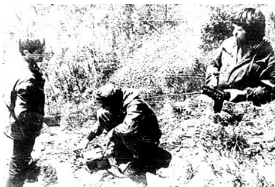
Soviet scientists investigating site of alleged UFO crash in 1986 on hilltop in Dal' negorsk, near city of Vladivostok in eastern Siberia.

As mentioned before, the sample of the 'netting' element is made of amorphous carbonaceous materials with metal atoms standing separately. The basic elements carbon basis, Zn (Zinc), Ag, Au, La, Pr, Si, Na, K, Co, Ni, Y and many others. It is almost impossible to interpret its structure. It resists the acids. When a temperature of 2800 Centigrade is applied to it in the air, some elements would disappear and new elements appear instead. In vacuum heating, gold, silver and nickel disappeared and molybdenum and beryllium sulfide appeared. The latter disappeared after five months. This does prove, however, that we are dealing with artificial materials. The great quantity of organic matter might be the sign of a type of life still unknown to us.