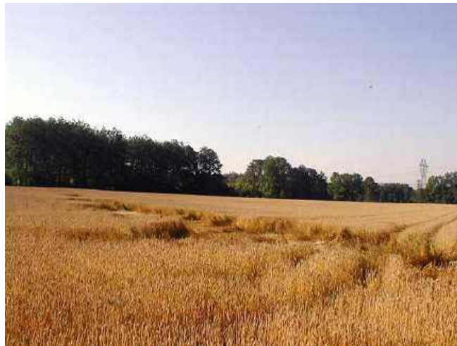
June 13, 2003, Prince William County, Virginia, downed wheat after blasts of pale blue light in field the night before.

Yes, quite a number of them. There is an excellent case from last year in 2003. It was soon after I investigated the eyewitness report of three crop circles forming before a man's eyes in Mayville, Wisconsin. See: 09-12-03 Earthfiles . I was contacted by another gentleman in Prince William County, Virginia, who saw what he described as crop circles forming. He said he was in his house and saw lights coming from quite a distance and saw several balls of lights 'tumbling' in the air. They came to a stop above the field adjacent to his house. He watched them shoot blue beams into the field blue pulses of light and the next day, he went out there and found flattened crop all over the place.