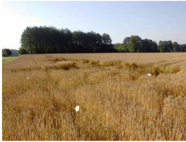
June 13, 2003, "chrome spheres" as seen by the eyewitnesses appear as white, bright spots on film.

But when his photographs were developed, they turned out to be white on his film. I have three or four photographs he sent to me of white spheres of light, three in one photograph. These are not from flash photography. This is daytime stuff with balls of light kind of floating over the top of the wheat. It's a fascinating case. What I wrote down here from him is: