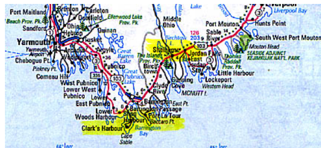
Shag Harbour and nearby Clark's Harbour are at the southern tip of Nova Scotia, Canada.