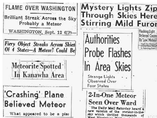
The night of September 12, 1952, eyewitnesses along the entire East Coast of the United States and inland such as Flatwoods, West Virginia, saw and reported "flaming" objects and "strange lights" in the sky.