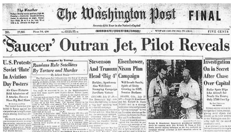
Monday, July 28, 1952, The Washington Post , Washington, D. C.

Around midnight on July 19, 1952, radar operators at Washington National Airport noted several 'blips' on the radar over Washington D.C. The unidentified blips traveled at 100 to 130 mph, but then would accelerate suddenly to speeds in excess of 7,200 mph. Washington National Airport and other radar operators confirmed the radar activity with each other and with Andrews Air Force Base. A week later on Saturday, July 26, 1952, "glowing aerial objects" showed up again on radar over the Nation's capital and The Washington Post even ran a story about one jet pilot's encounter with a "saucer that outran" him.