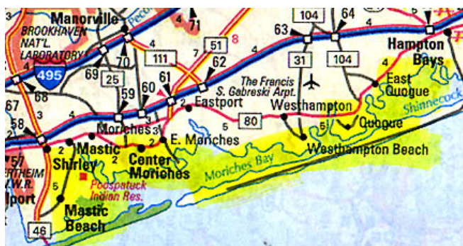
Moriches Bay and surrounding communities on Long Island, New York, south of Brookhaven National Laboratory. Quogue is south of the Westhampton Air Guard facility.