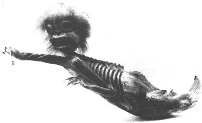
Unidentified creature was provided by Christian Page as "Oriental rendition of a mermaid." Image source unknown. Below: