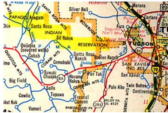
Papago Indian Reservation west of Tucson, Arizona.