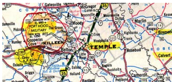
Fort Hood, Gray AFB and regional towns of Temple, Bremond and Calvert and the Brazos River lay between Waco, Texas, to the north and Austin, Texas, to the south.

"In the latter part of 1973, the entire Southeastern section of the U. S. was undergoing a wave of UFO sightings. The Central Texas area had an unusually large number of reports coming out of the farming communities around Calvert, Bremond, Temple and a few other small towns which are east of Fort Hood.