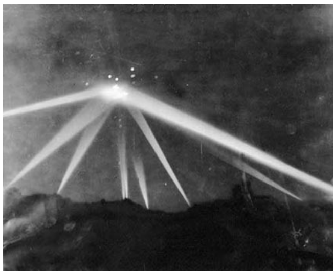
Actual photograph taken of eight search lights aimed by American anti-aircraft batteries at an unidentified object or objects during the "Battle of Los Angeles" some time after 3:06 a.m. PT, February 25, 1942. Santa Monica, California, hills are silhouetted.