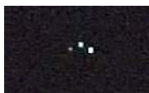
Triangular object with red and green lights was videotaped for about five minutes on May 31, 2004, as it slowly cruised to the south over Sonora, California, and passed very close to a helicopter.

COULD YOU TALK ABOUT SOME OF THE TRIANGLES THAT YOU HAVE GOTTEN WITH THE UNDERSTANDING THAT WE DON'T KNOW WHAT THE