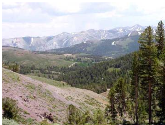
Marine Corps Training Camp is located near Sonora Pass, California, about 25 miles east of Mark Olson's apartment.