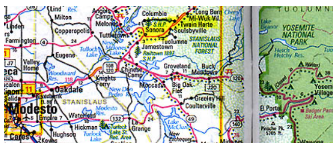
West of Yosemite National Park at the edge of Stanislaus National Forest is Sonora, California, in Toulumne County.