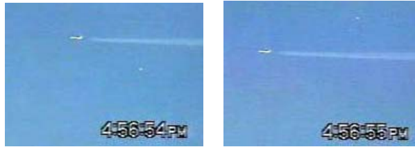
Two camcorder frames one second apart as white object circled the jet's contrail, May 14, 2004, over Sonora, California.

That was happening so much, I decided on May 13, 2004, to go out and buy a digital camcorder. I started practicing with that and the very next day on May 14, 2004, I was watching and videotaping an airplane and its contrail and this object just dropped down from the top of the screen above the plane and slightly behind it and went behind the contrail, did a crazy maneuver where it looked like it stopped on a dime a couple of times and then shot straight up again in front of the contrail.