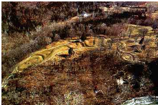
Photograph of ancient Serpent Mound near Locust Grove and Peebles, Ohio.

Mound is 800 meters long (.5 miles) and its construction is placed around 800 A.D.