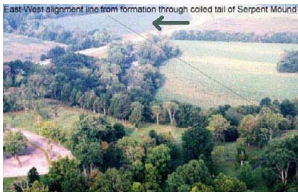
Arrow points at the soybean formation through early morning mist. Thin black line extends from the formation to lower right beige clearing which is the tail of the Serpent Mound.

Soybean formation was 3,000 feet ( a little more than a half mile) to the east of the serpent's tail shown at left of photo.