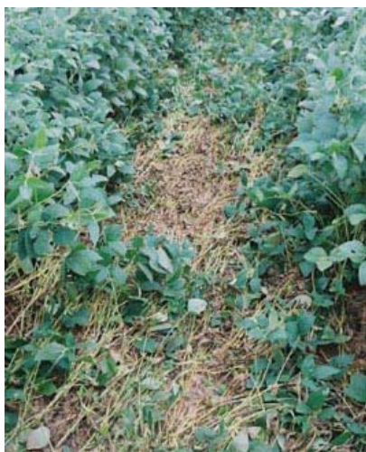
Brown, damaged areas were mixed among the still-growing soybean plants laid down clockwise in the large outer ring of the formation.