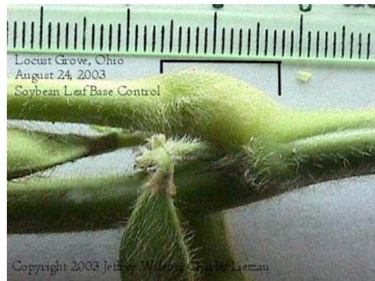
Normal soybean leaf base sampled as a control for comparison to plants gathered from inside the Serpent Mound formation.

In the downed soybeans of that unusual 2003 Serpent Mound crop formation, researchers found a layer of heat damage at the base of the leaf stems. The implication was that some kind of energy interacted with the soybean plants and heated up those cells. [See 090603 Earthfiles . ]