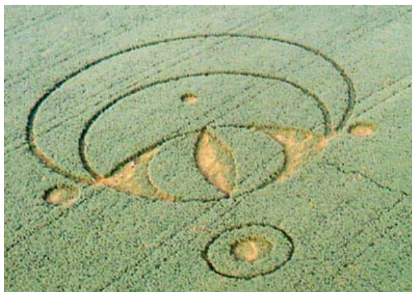
Serpent Mound soybean formation first discovered August 24, 2003, was 271 feet from top of large ring to bottom of small, ringed circle, all oriented east to west. The diameter of the "Eye" in the Vesica Piscis was 74 feet.