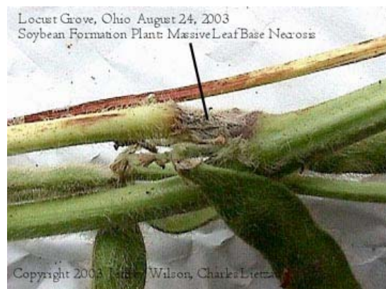
Soybean leaf based sampled from within the Serpent Mound formation which shows deterioration, possibly caused by heating.