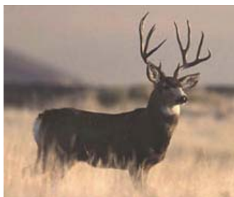
Mule deer.

Another deadly prion disease attacks deer and elk. The New Mexico State Dept. of Game and Fish reported today that two mule deer captured in the Organ Mountains near Las Cruces have tested positive for CWD. That means eleven animals in that same southern New Mexico area have been infected with the prion disease since 2002.