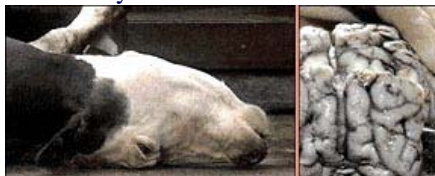
Cow infected by Bovine Spongiform Encephalopathy (BSE) that destroys brain tissue (on right) with a myriad of holes that resemble a sponge.

June 27, 2005 Washington, D. C. - The U. S. Department of Agriculture confirmed on June 25, 2005, that the second U. S. cow in 18 months has tested positive for bovine spongiform encephalopathy, or BSE, also known as Mad Cow disease. The first case of Mad Cow found in the U.S. was in December 2003 in a Washington state dairy cow that had been imported from Canada. This 2005 infected cow was at least 8 years-old and rumors in the cattle industry are that the animal was born and raised in Texas. If so, this would be the first confirmation that the always fatal BSE prion disease that destroys brains and nervous systems is in some American cattle and not solely linked to imported animals, as once previously thought.