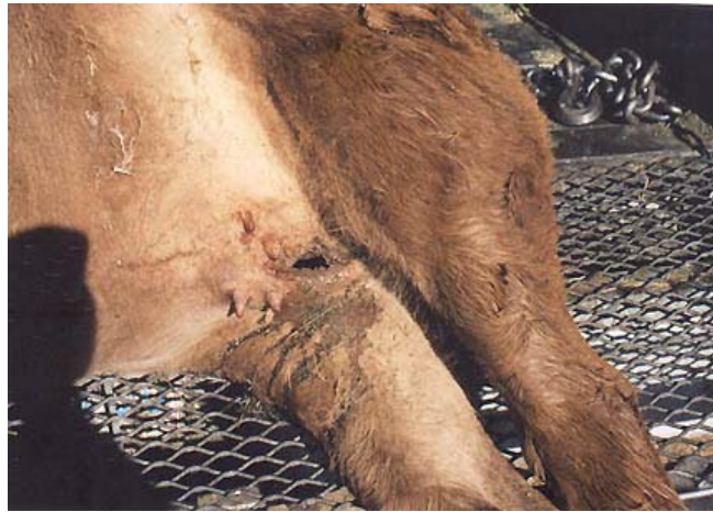
Taliaferros had previously castrated calf, but remaining scrotum tissue - and possibly entire penis tissue inside belly? - were excised at hole near the steer calf's undeveloped teats.

Another photo I took is of the groin area of the steer calf. It was rather odd that they chose to make a hole there. Once again, you can see by the way the animal is laying there that the hole was probably more rounded when I was there to look at it, but in the photograph, they had moved the calf. But this animal had been castrated shortly after birth. I think they put a rubber band on the testicles and there would have been nothing there.