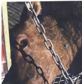
Left side of steer's head totally untouched.

From my own experience, you can't remove anything like that in that exact size without doing other damage to that head area. The hole went down in there at least 3 inches, if not further. You can't just stick a knife in there and cut around that hole and remove it that way because you are going to pry on the edge and the eyelid is going to get damaged. It's physically impossible, at least for me to do it.