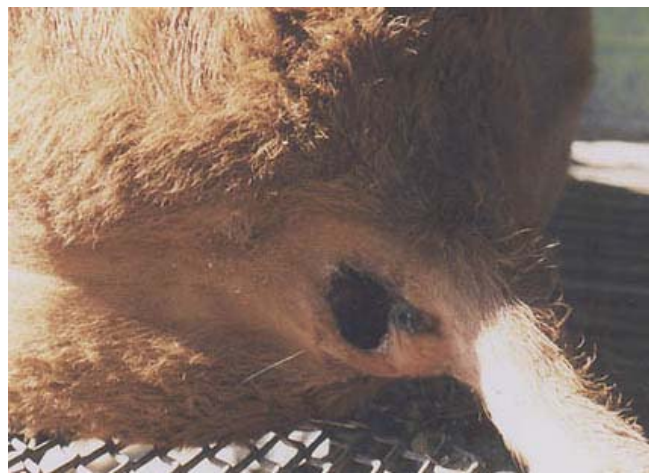
Circular, deep excision of rectal and internal tissue from Mark Taliaferro's steer calf.

My photograph of the rectum area of the calf - the hole was shifted somewhat by the way the animal was laying on that tailgate. But to me, it was just an almost perfectly round, surgical cut. It was almost as if it was cauterized. There was no bleeding and didn't appear to be any disturbance of other tissues just straight in as far as we could see into it.