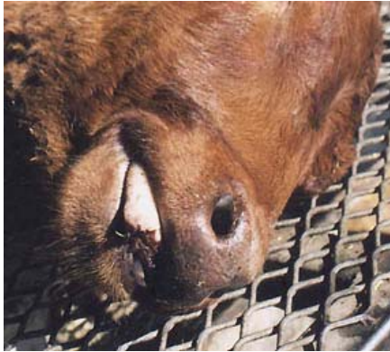
Tip of steer calf's tongue cut off on 45 degree angle, according to Pondera County Sheriff Tom Kuka, who took this photograph.

Yes, the tongue was interesting. It was cut at almost a 45 degree angle across there. Sorry my photo doesn't show it so clearly. The other mutilations we have seen, the tongues were gone completely deep in the throat. Why did they just take the tip of this one and at that angle? I'm at a loss again.