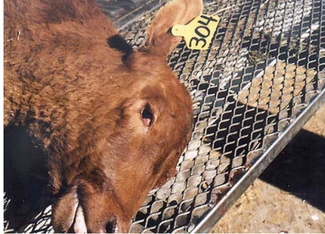
Right eyeball, optic nerve and bone "cored out" of steer calf.

If you look at the photo that shows the head with the ear tag, 304, on it, that right eye is gone. We also rolled the steer over and out of that empty eye socket poured 8 ccs approximately of blood. That was odd because all the other mutilated animals I've worked with never had any blood in the eye sockets. Once again, it was like the same tool was used in the eye. It was precisely, surgically removed, it appeared to me. It was a very round, cylindrical cut straight in - the mutilators would have gotten the eyeball and maybe some of the nerve behind it? Is that a common practice they do?