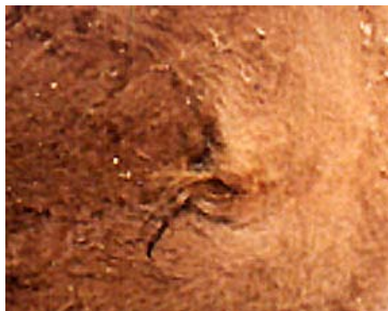
Close-up of hair around urination hole at middle of steer calf's belly. No necropsy done, so not known if penis removed inside abdomen.

Right, but even the picture of the calf on the tailgate where you can see the whole calf - if you look dead center, you can see where the tuft of hair is around urination hole. But I don't know if penis was there or not.