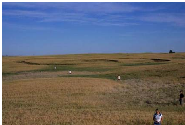
High River, Alberta, Canada, ringed circle, reported August 28, 2005. Redness in upper right of photo below unidentified.

"The formation has already been visited by a number of people. No tracks reportedly were seen initially, but there are not quite a few from all the visitors. The land manager (not owner) is calling it 'vandalism,' so he does not want any publicity. A few people reported cell phone problems inside the formation."