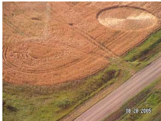
Simple circle reported August 27, 2005, near Steelman, Saskatchewan.

A simple circle was reported in wheat near Steelman, Saskatchewan, on August 27, 2005. The circle measured 23 meters (76) feet and the plants had been laid down counter-clockwise. This 2005 circle is near two other simple circles found in 2003.