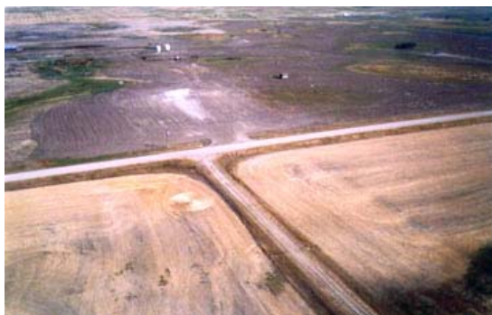
Second simple wheat circle reported on August 25, 2003, near Steelman, Saskatchewan, Canada, was one of two in same area that year. Now on August 27, 2005, another simple circle was reported in Steelman.

spiral pattern. It was like a carbon copy of the first circle in Steelman (this year), although in this case the field had already been harvested. With the plants pressed flat to the ground however, the circle itself was still quite intact and in good condition by the time of our investigation. ...While stretched nodes or nodes with expulsion cavities weren't found, stems with twisting below the seed heads were, similar to other cases in Canada this year at Revenue, Saskatchewan and Wallacetown, Ontario and in Canada and other countries in other recent years."