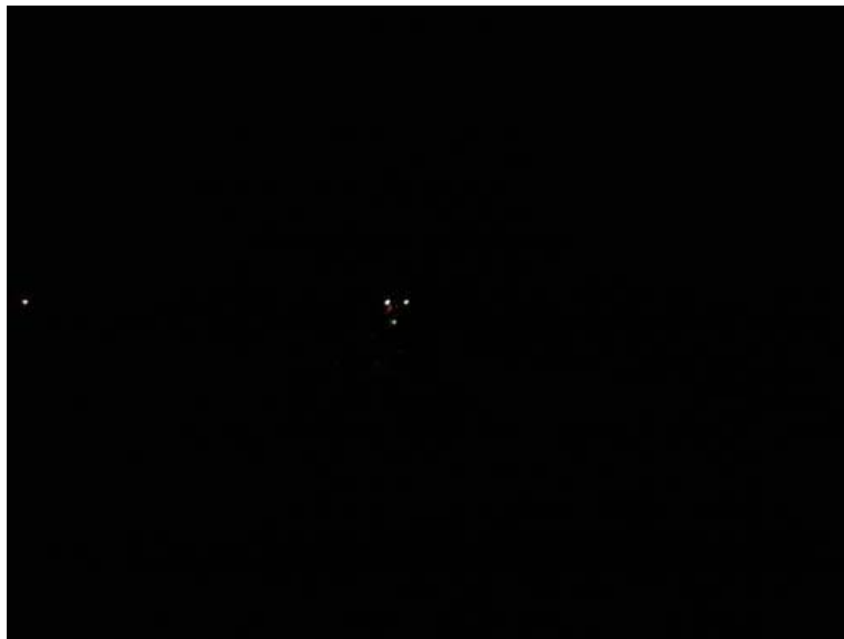
Digital frame 64 (full and as taken, not enhanced), unidentified aerial craft followed by white light to the far left of frame.

I only had the one wide shot. Then, what I did when I downloaded this to my camera, that's when I noticed that little white dot that was trailing the group of three lights. I didn't even see that when I took the picture. But I downloaded it at my computer and I have a software program called Photo Studio 2000. I was going to crop my photo and send it to my son, who is a pilot. I went ahead on the original picture, I just took one picture and blew that up and then captured it, saved it. I did not change the original. I just saved that zoomed portion of the picture. That's how I ended up with the two pictures: one is I have the original intact as it was downloaded and then I have also the one I captured that was zoomed in the Photo Studio 2000.