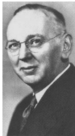
Edgar Cayce at age 55 in 1932.