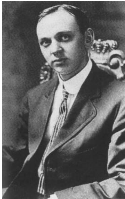
Edgar Cayce 1877-1945. Photo at age 32 in 1909.