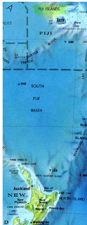
Fiji island chain north of Auckland, New Zealand, which is also north of Antarctica.

2006) and was centered 60 miles NNE of Ndoi Island in the Fiji island chain at a depth of 579 kilometers (360 miles). Associated Press reported: "There were no immediate reports of injuries or damage and the Hawaii-based Pacific Tsunami Warning Center said it did not expect the quake to trigger a damaging Pacific-wide tsunami. A seismologist at Fiji's Mines and Resources Department, said the quake was too deep to have been felt anywhere in the Fiji islands. Fiji is regularly hit by earthquakes in its 332 islands - about 110 of which are inhabited - because it sits in an active seismic area in the South Pacific."