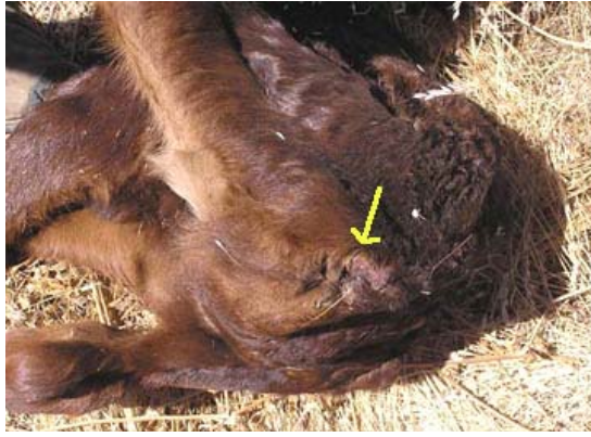
Yellow arrow points at tail excision in neat cut through tail bone from newborn heifer.