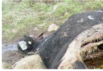
Bull's ear tag # 726 intact in right ear that was cut in half with straight line.

Then on the ear, there was the ear tag # 726 and a straight cut across the ear. Usually, they are completely gone down by the base of the skull. But this one, probably because of the ear tag, was just a clip.