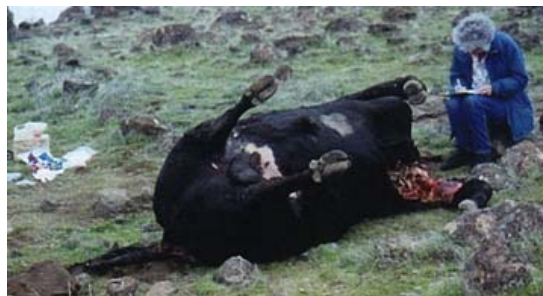
Dead and mutilated 2,000 pound bull discovered January 17, 1997, by owners Jean and Bill Barton on their winter ranch near Red Bluff, California. BLT Research, Inc. field investigator, Jean Bilodeaux, collected tissue.

Biophysicist W. C. Levingood in Grass Lake, Michigan, thinks a very complex set of energies are involved. He began studying soil and grass samples from mutilation sites. A similar pattern of respiration changes in plant cell mitochondria were repeatedly confirmed around animal mutilation sites, including grass collected near the rectum of a mutilated bull discovered in northern California on the Jean and Bill Barton Ranch in Red Bluff, on January 17, 1997, south of Redding.