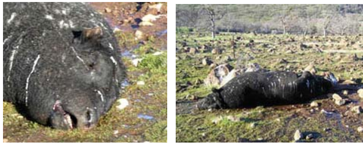
Bull found dead with bloodless excisions January 4, 2005, on the Barton Ranch.

Five months later on January 4, 2005, back south on the Red Bluff ranch, Jean and Bill Barton found another of their bulls dead and mutilated at the bottom of a steep hill.