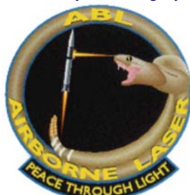
Airborne Laser Logo for D.O.D.'s Star Wars Space Policy Project. See website below.

"If it was not a joint USAF-USMC air-ground exercise, then I have no idea what an AC-130 would be doing firing at the ground near Brawley. The use of this aircraft for a Drug Interdiction mission would seem rather extraordinary. I also thought about test firing of the Airborne Laser System, yet normally when it is fired, there is a solid shaft of light and not a series of energy "bolts" or "bars" as with the description from Brawley. This is a very interesting mystery."