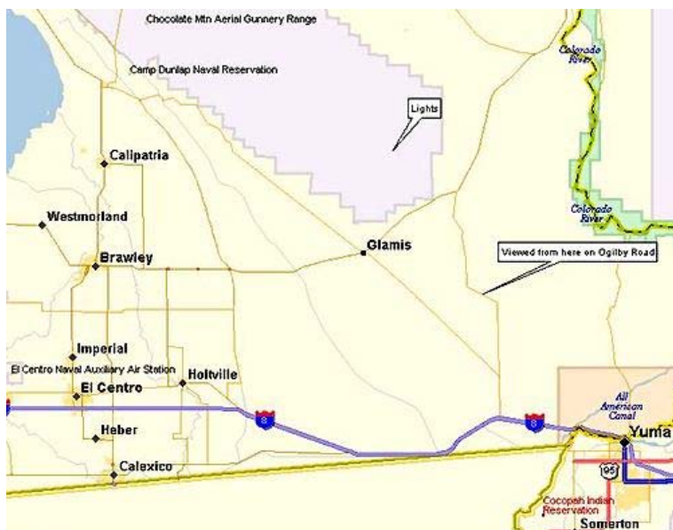
Location of aerial beams of light specified on map as "lights" at southeastern part of Chocolate Mountain Aerial Gunnery Range north of Brawley, California and northwest of Yuma, Arizona. Map © 2006 by M. S. for Earthfiles.

some type of technology that the public has not been told about."