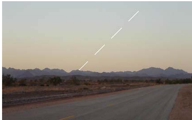
Illustration of disconnected, huge, aerial light bars superimposed on photo of actual location north of Brawley, California, on February 7, 2006, seen around 11 p.m. Pacific time.

Suddenly, there was what appeared to be several huge - and I mean really huge - fluorescent white beams of light that were all of the same length and spaced evenly apart, coming down at about a 225 degree angle (0 being straight up), in other words, at a downward angle toward the left halfway between straight down and horizontal. The fixed length beams of bright white light appeared to come out of the black sky, probably from at least a couple of thousand feet in the atmosphere, and at a reasonably slow pace made their way to the ground. There are mountains or hills in the way so I could not see the ground or destination where the light beams were directed.