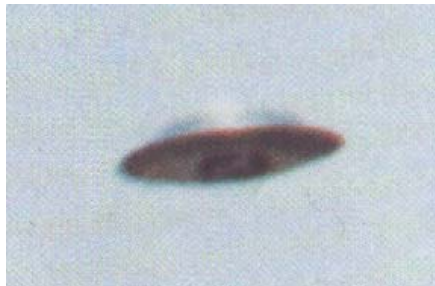
Upside down "pie pan" aerial disc, Winkelriot, Switzerland. Photograph © 1976 by Billy Meier.

He said they were a large, silvery disc that looked like a pie pan turned upside down. He said that they would circle the rockets and follow them. And then like several times, the radar equipment would lock in on the missiles and the rockets would crash.