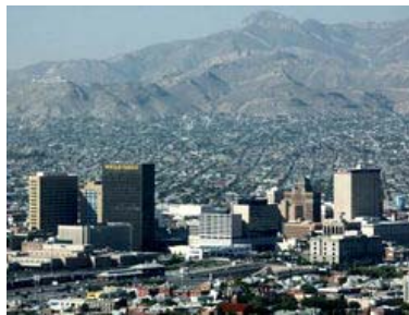
Franklin Mountains rise above El Paso, Texas.

"When my dad would mention the V-2 crash in Juarez, Mexico, it was with disdain! As a kid we used to climb up to several plane crash sites on the Franklin Mountains above El Paso, if my memory serves, in the 1949 to 1951 era you spoke of. The crashes at the time were blamed on the weather, but even as a kid I would think, 'Why are they so low on the mountain?'