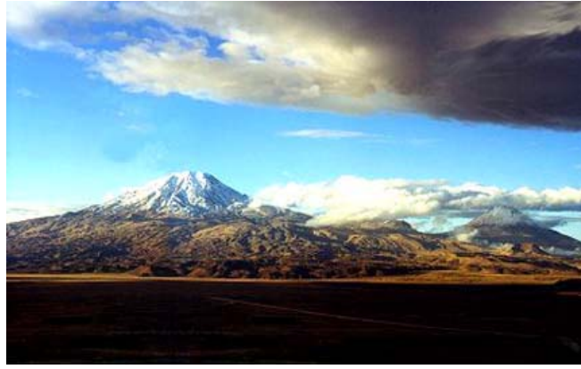
Mt. Ararat in eastern Turkey near Iran and Armenia borders.