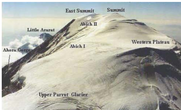
Mt. Ararat is a volcanic mountain that rises 16,945 feet (5,165 meters) in eastern Turkey on the borders of Iran and Armenia (former Soviet Union). Western Plateau is on far right in image above.