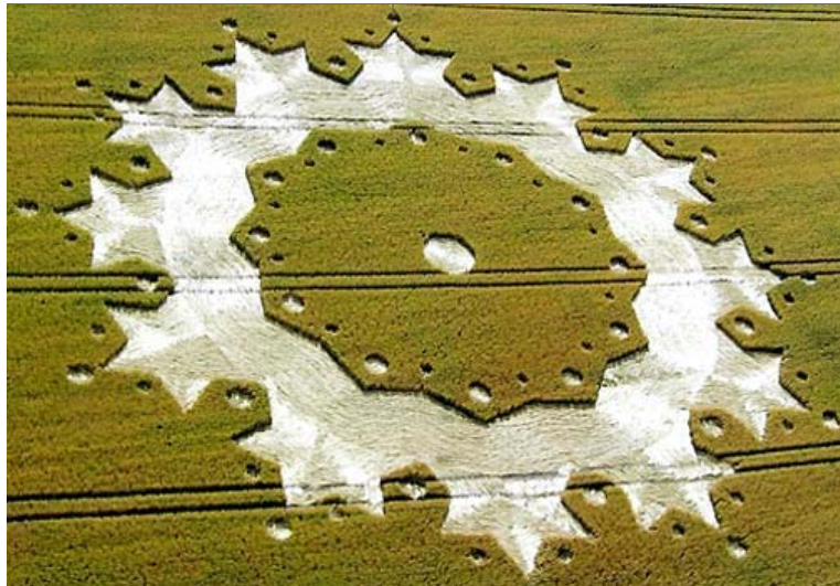
"Fractal snowflake" reported in wheat at Boxley, near Maidstone, Kent, southeast of London, on July 8, 2006; about 250 feet in diameter. Aerial image © 2006 by Andrew Fowlds.

Boxley, near Maidstone, Kent (southeast of London)