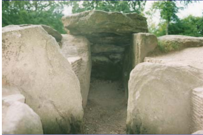
Rocks line the entrance to three empty burial chambers at Wayland's Smithy.

The trapezoid-shaped burial mound was built in two phases: the first was the structure of six large sarsen stones at the southern end in front of three rock chambers. The stone structure was first excavated in the 1800s. The second phase was the long barrow extending northward beyond the sarsen rock structure for 56.4 meters (185 feet) and 13.1 meters (43 feet) wide. Fourteen bodies were found, along with three arrow heads, pottery fragments and quernstones for grinding corn.