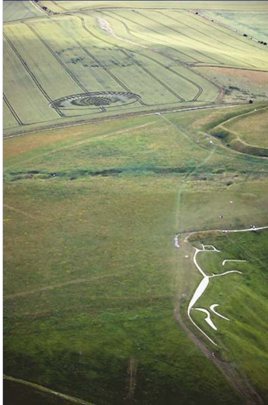
The elegant and ancient (est. 1400 to 800 B. C.) Uffington White Horse stretches along the ridge way above the wheat field to the north where a beautifully detailed "bird" in wheat was reported on July 8, 2006. Aerial image © 2006 by Cropcircleconnector.com .