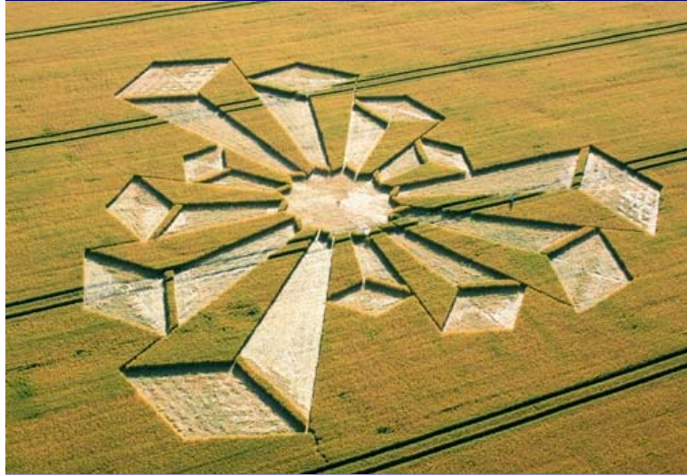
3 -dimensional "crystal," or "explosion," seems to rise out of the wheat growing near the 5,500-year-old Wayland's Smithy burial site one mile west of Uffington Castle. About 175 feet long, the pattern was reported on July 8, 2006.