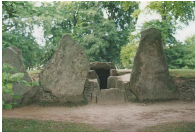
Large sarsen standing stones guard entrance to Wayland's Smithy 5,500-year-old burial chambers and long barrow not far from the wheat field in which the 3-D formation was found on July 8, 2006.

The English Heritage information plaque at Wayland's Smithy says: "About 5,500 years ago a tomb was built on this hill-top. The oval mound was made of chalk dug from two side ditches and was edged with stone slabs. It covered a wooden chamber containing the remains of about fifteen people. The tomb may have served as a focus for ceremonies that linked the living and the dead: it may also have marked the community's ownership of the surrounding land.