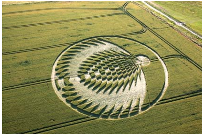
Aerial image