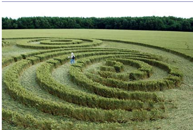
Pole shot of Savernake Forest crop formation near Marlborough, Wiltshire, reported July 8, 2006, in wheat.

The Roman ring is a very stable configuration, and the 'chronology protection conjecture' of (astrophysicist Stephen) Hawking does not prevent it."