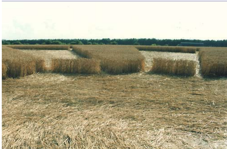
T wo of the twelve "crystals" that seem to jut upward in the aerial images of the Wayland's Smithy July 8, 2006, wheat formation.