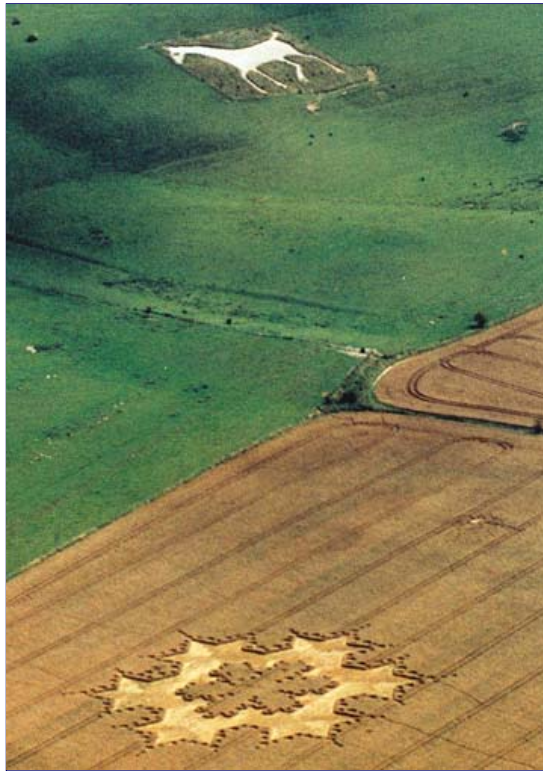
Fractal crop formation called a "double Von Koch snowflake" was discovered in wheat below Milk Hill White Horse in Wiltshire on August 8, 1997; measured 264 feet in diameter and had 198 circles.

The 2006 fractal pattern is reminiscent of the August 8, 1997, double Von Koch "fractal snowflake" that was discovered in wheat below the Milk Hill White Horse in Wiltshire, south of the Uffington White Horse. The Milk Hill fractal measured 264 feet in diameter and had 198 circles.