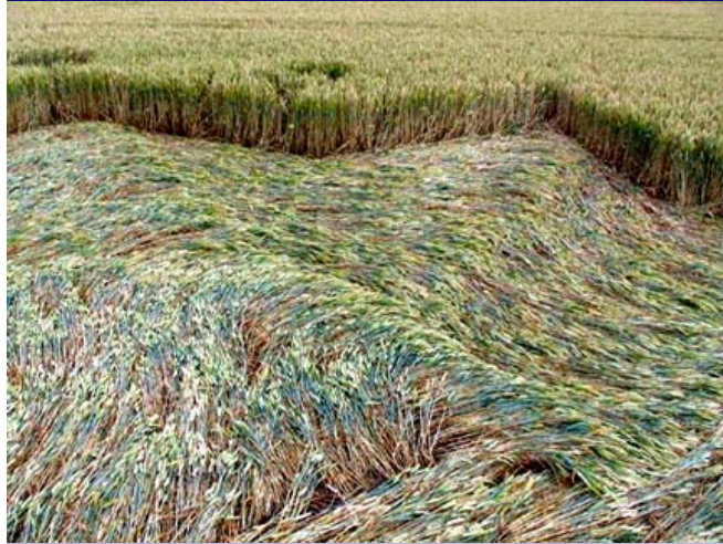
Liquid flow of wheat in the Boxley "fractal snowflake."

The 2006 fractal pattern is reminiscent of the August 8, 1997, double Von Koch "fractal snowflake" that was discovered in wheat below the Milk Hill White Horse in Wiltshire, south of the Uffington White Horse. The Milk Hill fractal measured 264 feet in diameter and had 198 circles.