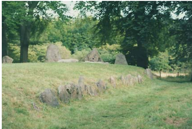
Wayland's Smithy long barrow edged in standing stones is 56.4 meters long (185 feet) and 13.1 meters wide (43 feet). Fourteen bodies were buried with arrow heads, pottery fragments and quernstones for grinding corn.

The trapezoid-shaped burial mound was built in two phases: the first was the structure of six large sarsen stones at the southern end in front of three rock chambers. The stone structure was first excavated in the 1800s. The second phase was the long barrow extending northward beyond the sarsen rock structure for 56.4 meters (185 feet) and 13.1 meters (43 feet) wide. Fourteen bodies were found, along with three arrow heads, pottery fragments and quernstones for grinding corn.