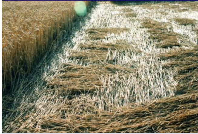
Close-up of one "faceted crystal end" in Wayland's Smithy formation.