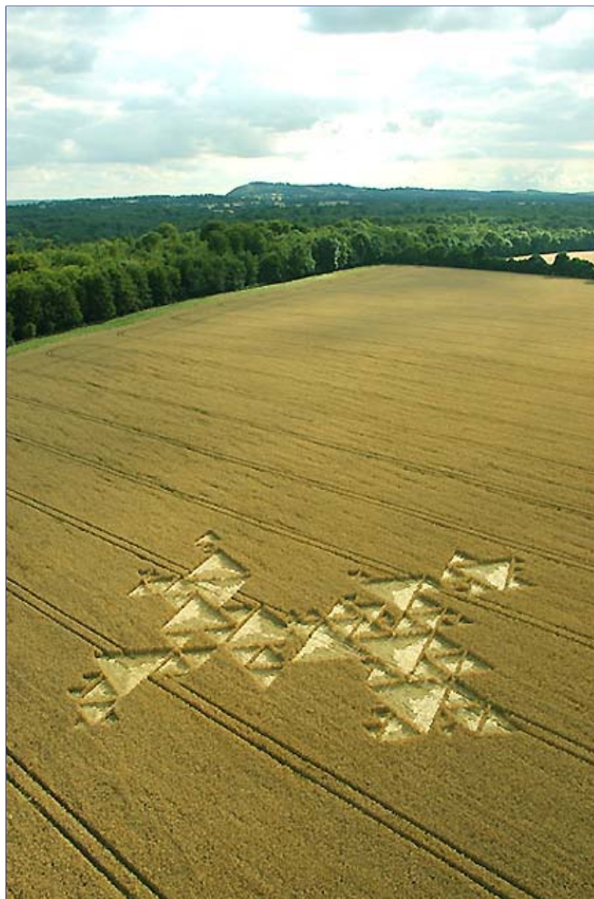
Seventy-eight triangles in fractal pattern were reported in Savernake Forest wheat field near Marlborough, Wiltshire, England, on July 19, 2005.