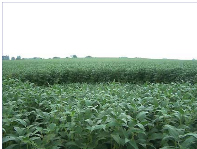
Twelve-foot-deep "wall" of soybeans between larger center circle and northern, smaller circle shown in this photograph taken on Saturday morning, August 19, 2006.