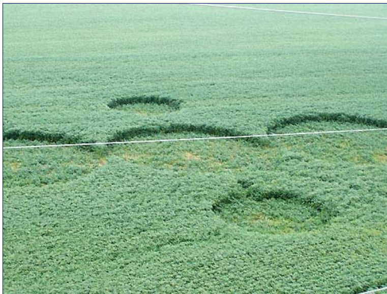
"Velvet carpet" around each circle and no pathway going into the far north, smaller circle at top of formation (camera aimed from southwest.)