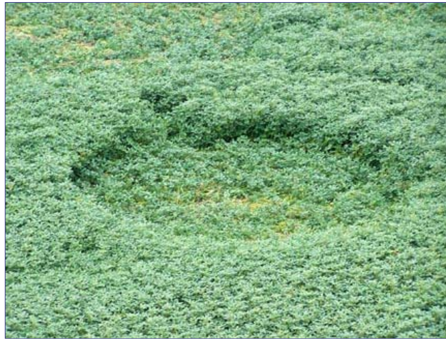
Southern, smaller circle that Jim Stahl walked into once on Saturday morning, August 19, 2006, before this photograph was taken from the Geneseo Fire Protection ladder truck. All five circles swirled clockwise.

IN THE 23 YEARS YOU HAVE BEEN FARMING HERE, HAVE YOU EVER SEEN SOYBEAN PLANTS GO DOWN LIKE THIS IN CLOCKWISE CIRCLES?