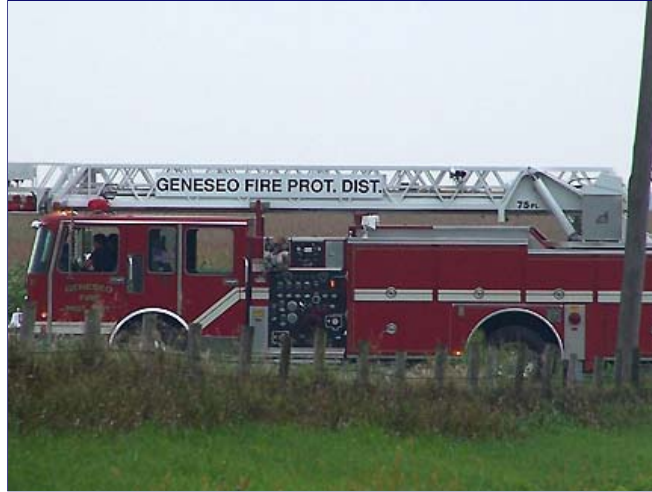
Geneseo Fire Protection District ladder truck parked on Middle Road next to the five circles in the Stahl soybean field around 11 a.m. CDT on Saturday, August 19, 2006.