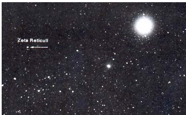
Above: Wide view of Zeta Reticuli I and II binary star system 39.41 light years from Earth. Zeta Reticuli I is a G 3/5 V Spectral Type sun and Zeta Reticuli II is a G2 V Spectral Type.