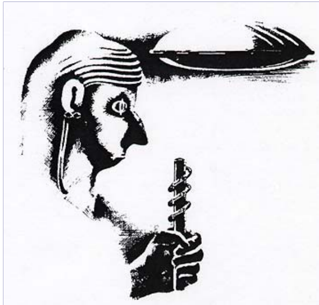
Plate 33 - Drawing of large-nosed alien being and disk-shaped craft in hypothetical landing at Holloman AFB from the Photo Section of UFOs: Past, Present & Future by Robert Emenegger © 1974, Allan Sandler Institutional Films, Inc. Reproduction of this drawing is prohibited without the written permission of Allan F. Sandler. Source: Page 277, Chapter "Other Beings," Glimpses of Other Realities, Vol. I: Facts & Eyewitnesses © 1993 by Linda Moulton Howe.

line nose thrown in as a red herring? I asked Emenegger twice and he affirmed each time the nose was correct.*