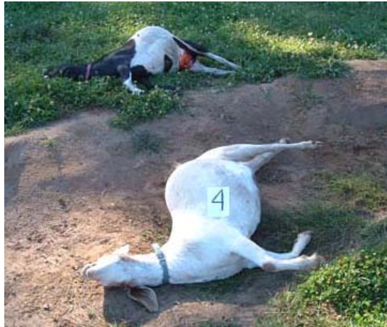
The fifth female goat, black and white behind the fourth goat, had its udder excised at the red site in this photograph.