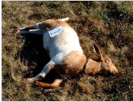
First female goat had no external excisions, but all six females had severely blackened lungs which baffled the veterinarian who performed necropsies in the field.