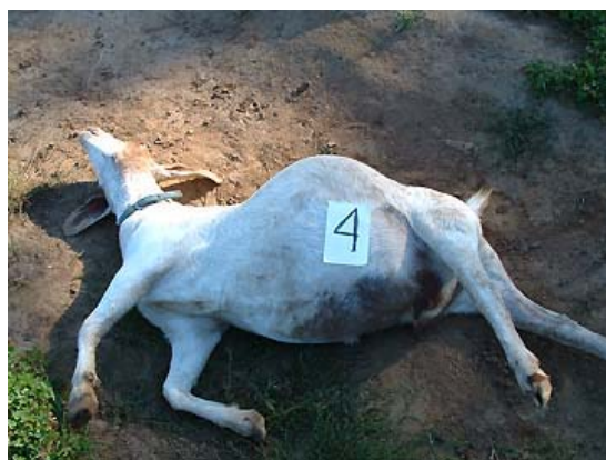
The fourth female goat was dead without any external excisions. Below her open eye and protruding tongue.