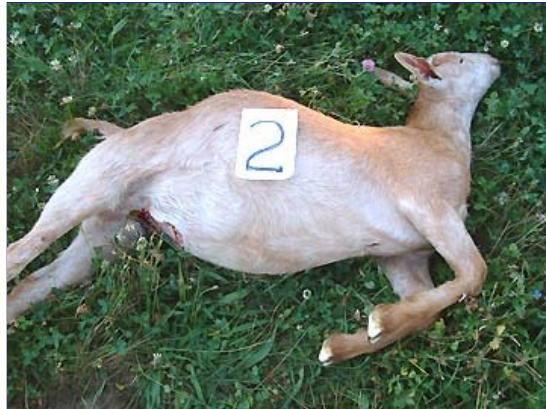
The second female goat had a neatly "scalloped" excision of its udder, a scallop pattern often found in udder excisions from mutilated cows.