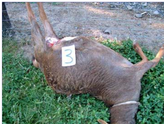
The third female goat had its legs up against the fence and head twisted up and to its right side. Its udder had been excised.