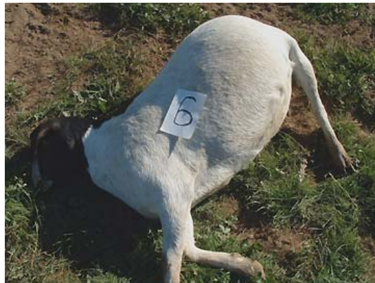
The sixth female goat was dead without any external excisions.

"We didn't know what's going on. The more we thought about it, we decided to call the Klickitat County Sheriff's office. Two deputies came about 7:30 a.m. (an hour later). One happened to be a retired Fish and Game man, who has seen animal mutilations. That deputy took one look at the goats and he said, 'This was not done by an animal. This was done by a knife.'