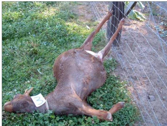
The two Klickitat County Sheriff's deputies who investigated placed a number that represented the body count before photographing on Wednesday, September 27, 2006.

One goat was turned literally up on her back with her legs up in the air leaning against the fence. That was when we saw her udder was missing.