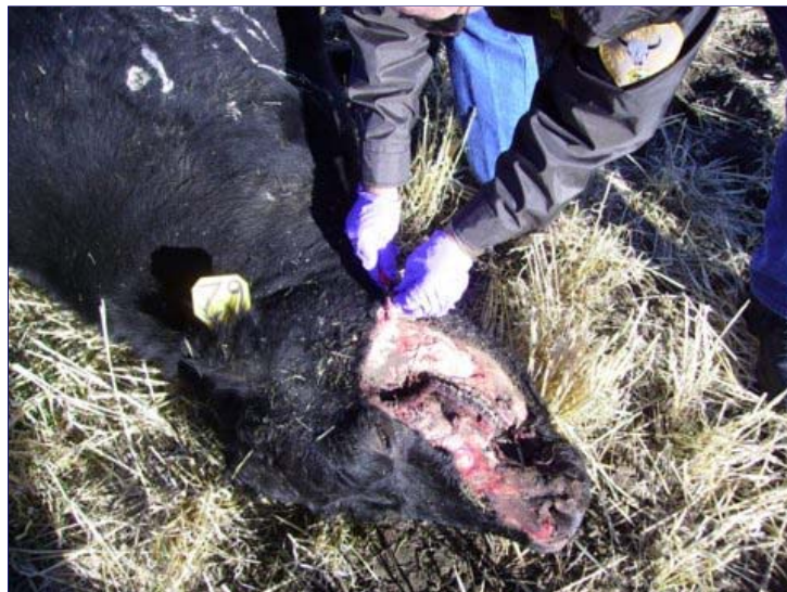
Left jaw bloodlessly stripped of flesh, as in the majority of animal mutilation cases since at least the 1960s.

We continued to move up on the animal, photographing it as we came all the way around. It was very typical to all the other mutilations we've had in this area. There was no sign of any struggle. There were no signs of any blood.