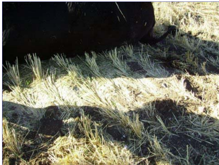
Barley stubble underneath black Angus cow is laid down going south, while the bounce mark the Sheriff investigated four to five feet southeast of the cow's body indicated the animal was first moving in a northerly direction.

This mutilated cow was lying in a harvested barley field. The stubble was approximately 3 to 4 inches tall. The animal looked like it hit and bounced to the north, but the stubble underneath it was bent south. And I still don't know how – I tried to figure out how it could have been bent that way. I really haven't got that through my mind yet how that happened.