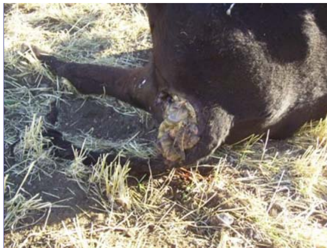
On the morning of October 12, 2006, three days after the neighbor first saw the cow dead, intestines were sliding out large rectal and vaginal hole that probably looked like image below of a typical animal mutilation.

Yes, that was done like it was all cored out at one time. But because of the time that had elapsed since the morning of Oct. 9 (when the neighbor first saw the dead animal and did not report it), the intestines were starting to come out.