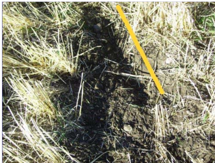
Yellow graphic indicates straight depression in soil "as if by a 90-degree angle" approximately three feet long found about five feet from cow's dead body.

It's like a piece of angle iron had set down there. It was very symmetrical, like something made from a right angle, or 90-degree angle.