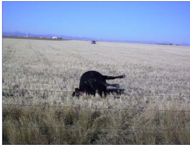
1200-pound black Angus cow found dead and mutilated on morning of October 9, 2006, in Valier, Pondera County, Montana. Alive and well with herd of 200 other cows in barley stubble field the night before as late as 5 p.m.

He decided to return the morning of October 12 with a Geiger counter and cameras. He talked to me this week about what they found in the daylight.