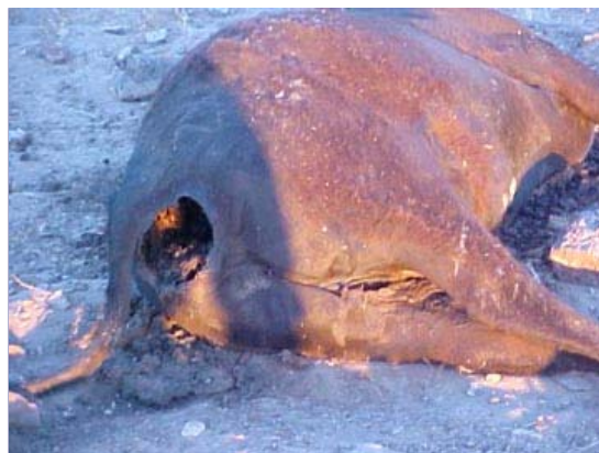
Cow found Fourth of July week, 2002, by BLM workers under fence wire on ranch in Christmas Valley, Oregon. Rectal and vaginal area bloodlessly cored out and left front leg broken and shoved into the cow's body as if dropped straight down on the leg from the sky.

THERE WAS NO BLOOD ON ANY OF THE EXCISIONS?