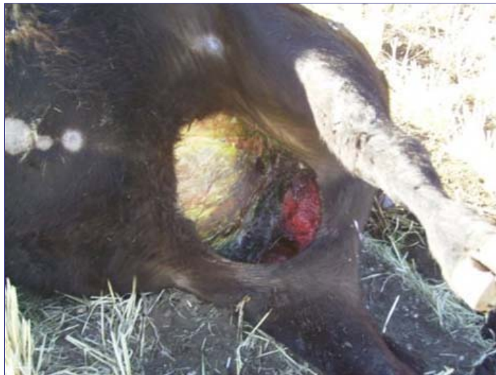
Cow's udder removed in smooth, clean cut. Sheriff Kuka said there was no blood on any of the excisions, but inside the abdomen, some blood had pooled (red above).