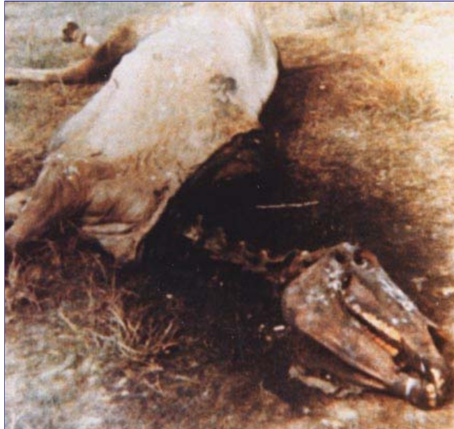
Lady, in same San Luis Valley spot where she had been found dead and stripped of flesh from the neck up three weeks earlier in September 1967.