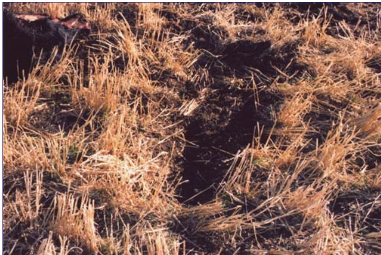
Near center of photograph is the bounce mark amid barley stubble where Sheriff Tom Kuka and his deputies found the barley broken off and the soil piled up to the north only a few feet from where the cow bounced down a second time, dead and mutilated. The cow's head in upper left corner shows the sky-facing jaw stripped of flesh.

The Sheriff had called me after his first October visits to the Peterson ranch to tell me there appeared to be a bounce mark some four to five feet southeast of the dead cow's body. The soil was shoved up against the north side of the mark, suggesting that the 1300-pound cow had dropped from high enough above to hit the ground with considerable force and bounced to its final resting place with its legs and head pointed north.