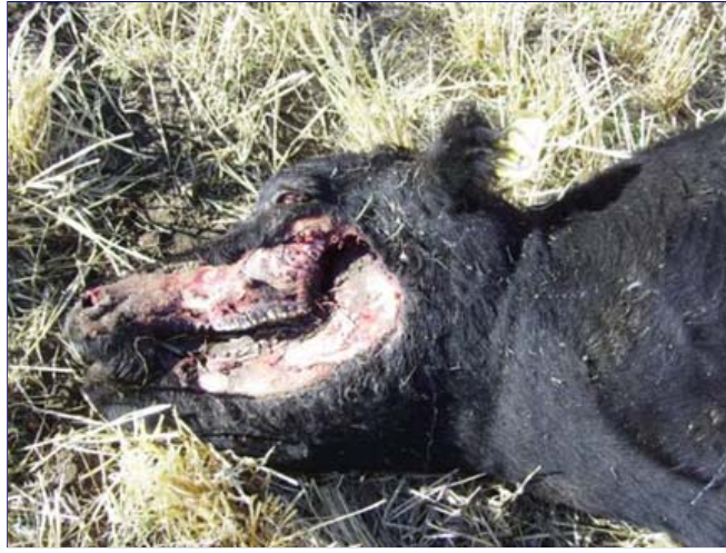
Left jaw bloodlessly stripped of flesh, as in the majority of animal mutilation cases since at least the 1960s.