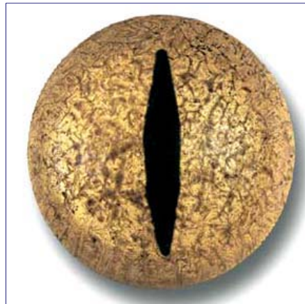
Glass reproduction of Earth reptile eye with vertical pupil. Image by Van Dyke's Taxidermy.

"The only apparent light source was on the face of this creature, like a hologram of a human face superimposed and glowing over the alien's face. It was radiating light and this was done to disguise his true scaly, reptilian appearance. He had done this to make me feel less apprehensive. The creatures didn't take into consideration that as this holographic face spoke and moved its lips, there was no audible sound.