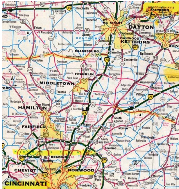
About fifty miles northeast of Cincinnati, Hamilton County, Ohio, is Wright Patterson AFB in Fairborn, Ohio. Norwood is a suburb northeast of Cincinnati.