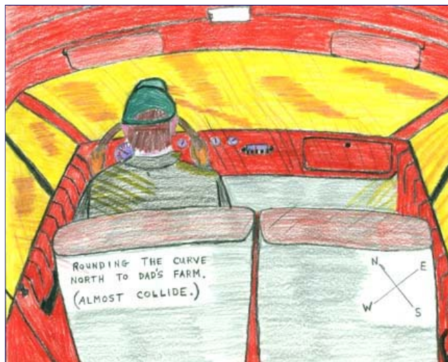
Large, amber-yellow, aerial light appeared to be on collision course with Lee Hudson. Drawing © 2007 by Lee Hudson.

But wrong. It didn't swing north. So when I started coming around north around the curve, this thing just keeps going straight across right in front of me. I thought I was going to hit it, or it was going to hit me. I remember my windshield just absolutely blotted out with light. When this thing crossed in front of my car, you could see nothing. It was just a blinding light glaring through the windshield.