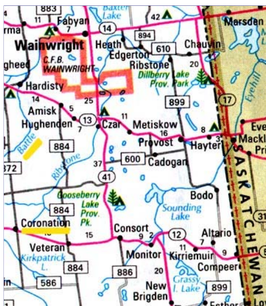
Coronation, Alberta, Canada, underlined in yellow. Battle River, north of Coronation, is also underlined by yellow. Outlined in red is the Canadian Forces Base Wainwright (C. F. B. Wainwright). The base has a 620 square kilometer training range used for live-fire artillery and armor and infantry exercises.