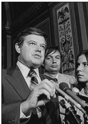
U. S. Senator Frank Church (D-Idaho) chaired U. S. Senate Select Committee to Study Governmental Operations with Respect to Intelligence Activities, 1975, Washington, D. C.

Facts about the CIA's propaganda and censorship relationship with certain American media executives came to light three years after the 1972 Nixon Administration Watergate break-in scandal. The 1975 hearing of the United States Senate Select Committee to Study Governmental Operations with Respect to Intelligence Activities was chaired by U. S. Senator Frank Church, Democrat from Idaho.