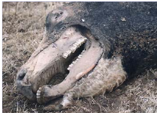
Mutilated steer found in Caldwell, Kansas, on January 31, 1992. The jaw flesh had been removed in a neat, bloodless rectangular excision, typical of thousands of other mutilated animals reported around the world since the 1940s.

So, there does seem to be this issue of surveillance and interference with military facilities. There might be other issues as well having to do with economic considerations and military hardware considerations.