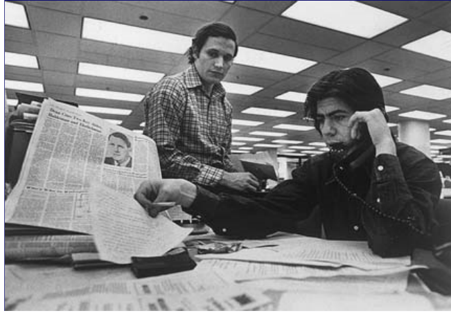
Bob Woodward and Carl Bernstein, reporters in The Washington Post offices at the height of the Watergate investigation, April 29, 1973, Washington, D. C.

Bernstein reported that in addition to The New York Times , "CBS was unquestionably the CIA's most valuable broadcasting asset. CBS president William Paley and Allen Dulles enjoyed an easy working and social relationship (with the CIA). Over the years, the CBS network provided cover for CIA employees, including at least one well-known foreign correspondent and several stringers; it supplied out takes of news film to the CIA; established a formal channel of communication between the Washington bureau chief and the Agency; gave the Agency access to the CBS news film library; and allowed reports by CBS correspondents to the Washington and New York newsrooms to be routinely monitored by the CIA."