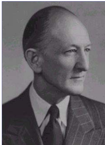
Former U.S. Marine Corps Major Donald Keyhoe. June 20, 1897 - November 29, 1988.

One of the highly controlled subjects for decades has been the UFO phenomenon. One military voice who tried to tell the truth about UFOs – that the aerial craft were not human-made - was U.S. Marine Corps Major Donald Keyhoe.