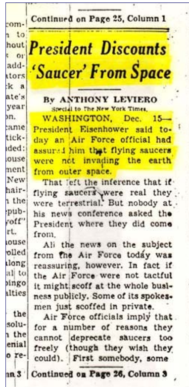
The New York Times , Front Page, December 16, 1954.

This was a topic of great concern at that time and on up into the late 1970s, flying saucers or UFOs were still flying over our nuclear weapons facilities and interfering with ICBMs, according to military personnel. [ For more information about Montana Minuteman missile silos and UFO phenomena, including bloodless animal mutilations, please see my book, An Alien Harvest , in the Earthfiles Shop and the reprinted Mystery Stalks the Prairie in the Earthfiles Archive . ]