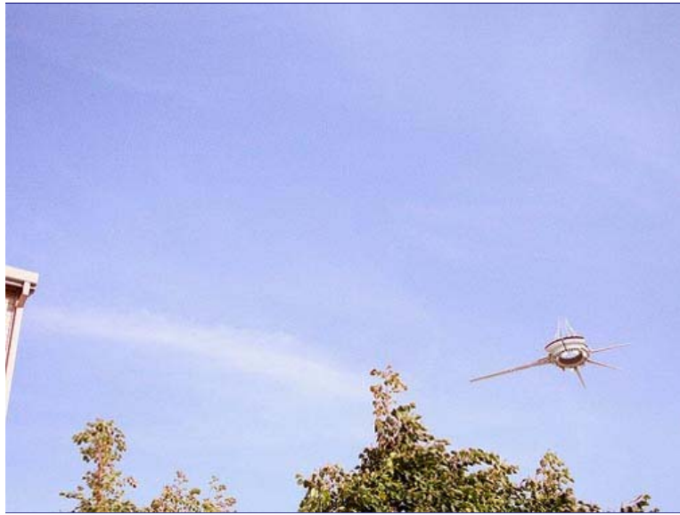
Rajman1977 Image 0014 , taken with a Konica Minolta DiMAGE X on May 16, 2007, in Capitola, California.