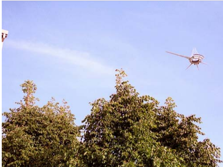
Rajman1977 Image 0013, taken with a Konica Minolta DiMAGE X on May 16, 2007, in Capitola, California.

Anyway, I created this Flickr account for the best of these pictures. I have no clue what this thing is so I'm putting it out there to see if anyone else saw it."