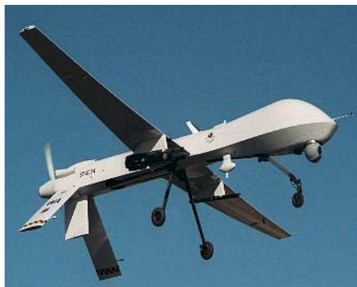
MQ-1 Predator, Nellis AFB, Nevada - Armed with an AGM-114 Hellfire missile on a training mission.