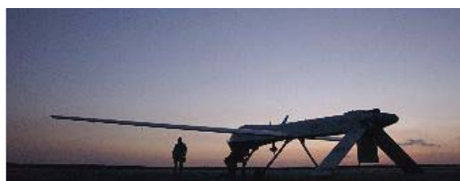
Predator, Operation Iraqi Freedom - A high-altitude aerial reconnaissance plane used for surveillance for ground forces.