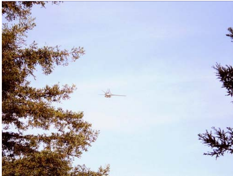
Rajman1977 Image 0018 , taken with a Konica Minolta DiMAGE X on May 16, 2007, in Capitola, California.