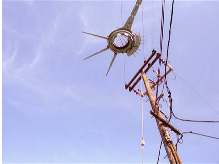
Rajman1977 Image 0017 , taken with a Konica Minolta DiMAGE X on May 16, 2007, in Capitola, California.