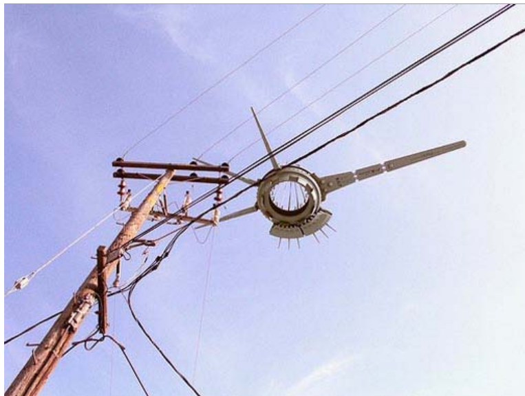
Rajman1977 Image 0016 , taken with a Konica Minolta DiMAGE X on May 16, 2007, in Capitola, California.