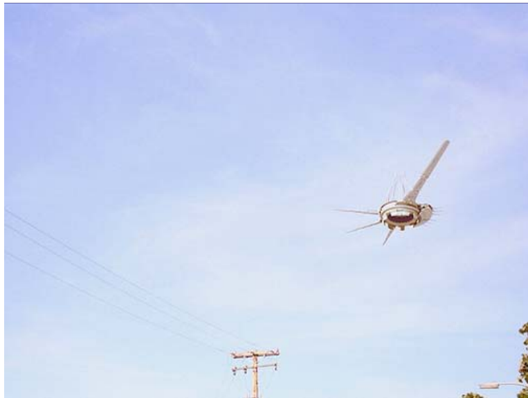
Rajman1977 Image 0015 , taken with a Konica Minolta DiMAGE X on May 16, 2007, in Capitola, California.