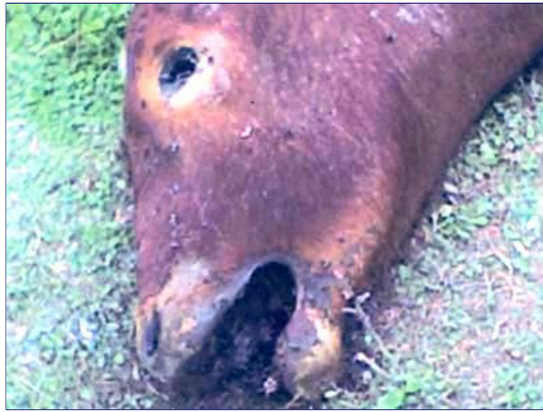
Photograph of one of the El Porron mutilated cattle provided by Argentina animal mutilation investigator, Guillermo D. Gimenez.

"They were found some three hundred meters (186 miles) from the home of farmer Julio Farias, who explained that 'it has been a week since we found the animals, and they haven't shown any signs of decomposition. Birds of prey are only now starting to approach the location.' Another notable condition is that no traces of blood were found at the site, or traces of having struggled against an attack. These animals were mutilated.