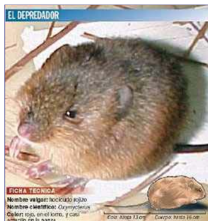
Oxymycterus , "hociquito rojizo" (red muzzle), a rodent now officially blamed by Argentina federal officials for the animal mutilations in Argentina since April 2002.

Recently I talked with Scott Corrales about the Argentine government's effort in July 2002 to explain away all the increasing cattle mutilations in half a dozen provinces by an official press release that said the perpetrators of all the dead animals were "red-nosed mice ... whose nutritional habits had changed to eating cattle." Even veterinarians there laughed at the government's explanation as preposterous. The veterinarians knew they had seen excisions on animals that showed signs of high heat as if cauterized and no red-nosed mice could do that!