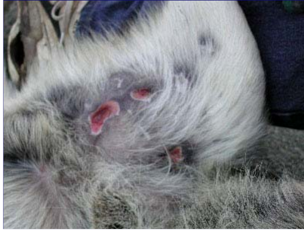
A Puerto Rico dog attacked by the chupacabras entity, which left bloodless holes in its belly.

Every two years, we seem to get a resurgence of these cases. I think it was back in 2003 or 2004 we had those cases in Chile, not Argentina, involving the winged simian creatures that attacked a farmer in Chile.