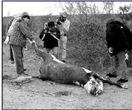
Specialists from Argentina's federal INTA agency (similar to USDA's Food Safety Inspection Service) are inspecting a mutilated cow in the La Pampa province in late June 2002. More than 3,000 mutilated cows, horses and other farm animals have been reported to local authorities in seven provinces.

May 25, 2007 Sumampa, Argentina - Beginning in 2002, there has been a wave of animal mutilations in Argentina. Authorities estimate there have been more than 3000 cases. Now again this April to May 2007, there have been cattle mutilation reports from Argentina and new chupacabras reports from Chile.