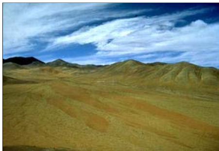
Atacama desert of northern Chile famous for strange creature sightings, aerial lights and unusual animal deaths.

WHEN YOU THINK ABOUT CHUPACABRAS IN CHILE, WHAT IS THE STRANGEST CASE YOU REMEMBER TRANSLATING.