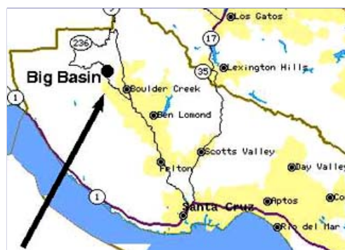
Big Basin Redwoods State Park is northwest of Santa Cruz, California.