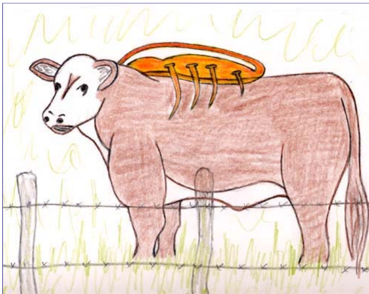
Unidentified "crab/scorpion" creature on top of cow bellowing in pain around 7:30 PM, in either August 1996 or 1997, on Highway 4 between Upland and Campbell, Nebraska. Cow was only 25 feet from John Click's semi-truck on Highway 4, Nebraska. Drawing © 2007 by Rev. John Click.

Yeah, it was just lying on top, but the legs were like about half way down it. The creature itself was probably three to four feet long.