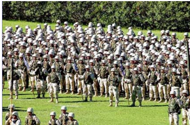
25th Infantry Division soldiers at Schofield Barracks, Oahu, Hawaii.