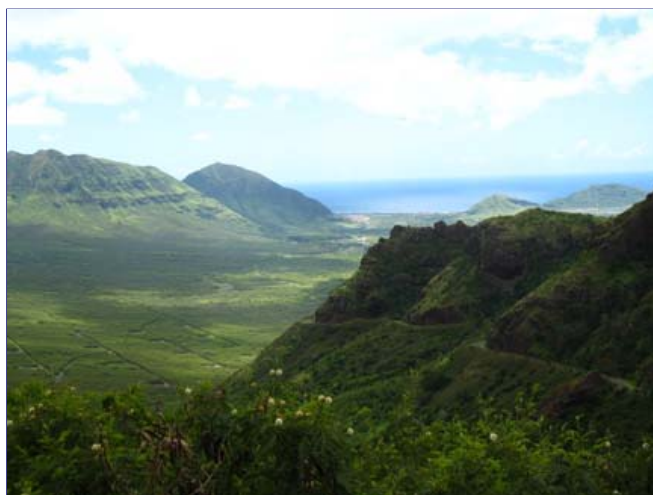
Schofield Barracks valley near center of Oahu, Hawaii.