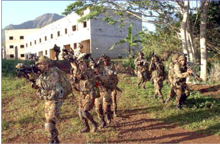
Soldiers from 2nd Battalion, 35th Infantry Regiment, move in to search buildings at the 3-story-high Schofield Barracks Military Operations in urban terrain site.