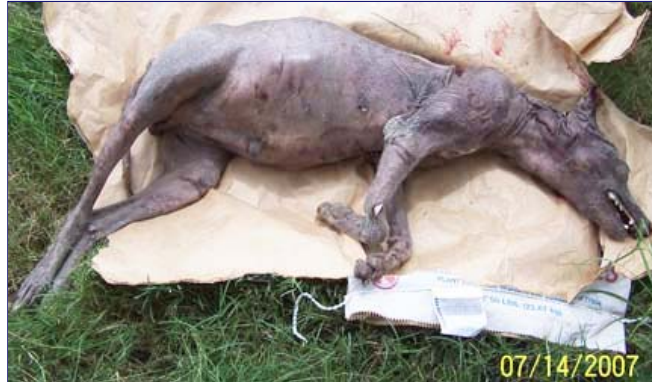
Cuero, Texas (hour southeast of San Antonio), July 14, 2007, odd purplish-gray animal with fangs overlapping in overbite and front legs shorter than back legs. This was second such animal found dead on Cuero road that day, this one in front of the 7C ranch.

I contacted one of my friends who is a veterinarian in Victoria. I had him look at it and the more we started to examine the animal, we definitely came to the conclusion that this is a very strange creature. On the very short front legs, the paws had a very big pad on the front feet. But the back legs were much longer and had no pads on the back feet at all, compared to the front. It had a very long snout with an overbite on the top.