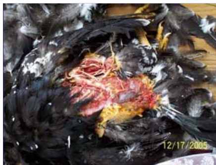
Chicken killed on 7C Ranch linked to unidentified gray animal seen on ranch, December 17, 2005, but death not like the clean, bloodless puncture holes of the "chupacabras" in Puerto Rico and Mexico from 1995 to 1996.

So, finally I decided to get some chickens. Then actually on video, I caught bobcats coming up to take the chickens and I got wild dogs coming up to take the chickens. But what was the most unusual is that it appeared when my videotape would run out, something would come up, kill the chicken, suck the blood out of it and leave the chicken lying there. After going through about 28 chickens, still the thing was very illusive. So, I have been very passionate at trying to find this animal and get it on videotape or capture it, so we could find out what it was.