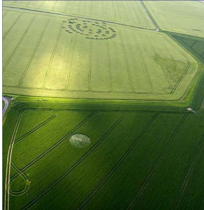
Yatesbury Field, Wiltshire, England, reported May 30, 2007, fifty-seven swirled barley circles in large spiral about 300 feet in diameter; in foreground, a 60-foot-diameter single circle in wheat. Also see: Cropcircleconnector.com .

It had rained the night before and there was mud everywhere when the first people walked to it. But there were no traces of mud anywhere on the spiral or circle - absolutely pristine! And the single circle in the field next to the spiral had the most extraordinary ground lay. I buried my little bottles of water in that circle to test for concentrations of nitrate nitrogen (NO 3 )."