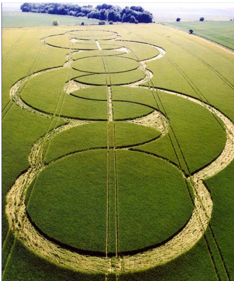
Wheat pattern 600-feet-long at Furze Hill near Beckhampton, Wiltshire, England, reported on June 5, 2005.

August 6, 2007 Petersfield, Hampshire, England - Lucy Pringle has been photographing crop formations from the air and on the ground since 1993. Her latest book, Crop Circles: Art in the Landscape , was released as a North American edition in July 2007. This book has prints large enough to study in detail - some photographs are given 2-page spreads. From her hundreds of English crop formation photographs since the early 1990s, Lucy focused on ninety-five crop formations. Her photographs sweep you into the page as if you were in the air with her. A good example is Furze Hill near Beckhampton and the ancient stone circles of Avebury reported on June 5, 2005.