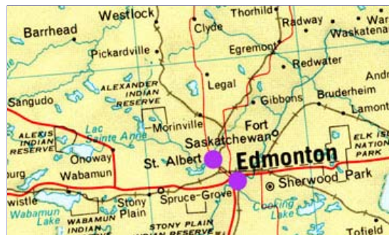
Edmonton and St. Albert, Alberta, Canada, are about 150 miles north of Calgary, British Columbia.

St. Albert's and Edmonton, Alberta, Canada