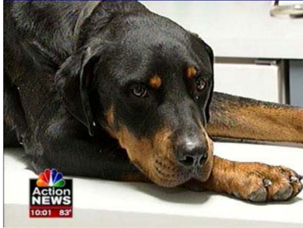
6-month-old Rottweiler, Misty, found on August 14, 2007, in northeast end of Kansas City, Missouri, with most of her left hind leg cut off.

On August 14, 2007, a 6-month-old female Rottweiler named Misty was found near the Kansas City Museum in the northeast end of Kansas City, Missouri, with most of her left hind leg cut off. The suffering dog was taken to the Raytown Animal Clinic for examination and treatment where the remainder of her leg was amputated.