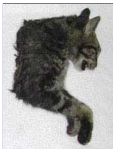
Front portion of male cat found first week of August 2003, in Bothel, Washington, similar to so many other half cats discovered in the U. S. and Canada since at least the 1980s.