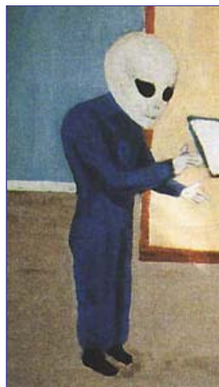
Left: Drawing of Grey entity by L. D., Southern California adult female, in 1980.