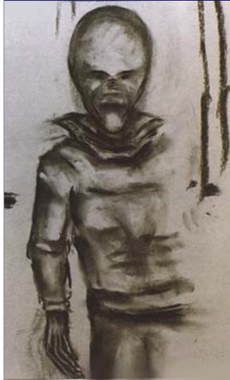
"Extraterrestrial Biological Entity (EBE)" Type I sketched by Colorado husband who was lifted along with his wife out of car on freeway north of Denver, Colorado, in November 1980. Upon seeing this and other sketches, one military source told me, "That is an EBEN." See An Alien Harvest and Glimpses of Other Realities, Vol. I: Facts & Eyewitnesses © 1993 in Earthfiles Shop .