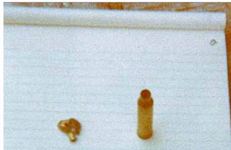
Left: Smashed bullet. Right: Spent rifle cartridge minus bullet.