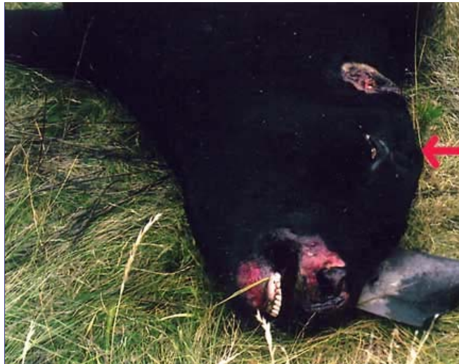
Half circle of hide removed above the right eye (red arrow) where the eyeball had been removed. Right ear excised at skull, tongue removed along with upper and lower lip tissue.

In addition to the penis and testicles, the bull's right ear and right eye had been excised. Right above the removed eye was also an excision only hide-deep in the shape of a half circle (see red arrow below). That was a very common finding in cattle mutilations throughout North America in the 1970s.