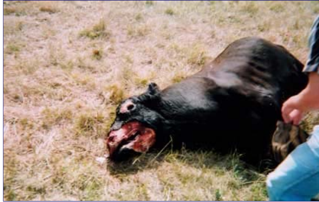
June 2006, mutilated bull on Guy Mills farm in Ansley, Nebraska, found at 5:30 AM was still warm to touch when Guy Mills found him.