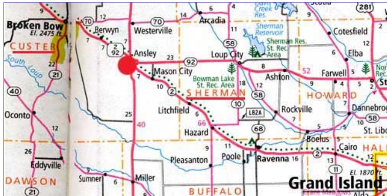
The Guy Mills ranch is in Ansley (red circle) with some pasture sections in Custer County and some in Sherman County.