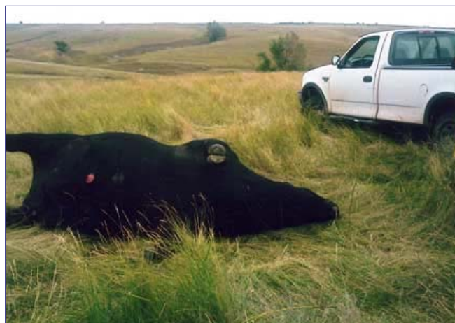
Mutilated bull found August 31, 2007, on the Guy Mills ranch in Ansley, Nebraska.

Only two months before that on August 31, 2007, the Mills found one of their big, valuable bulls lying on its left side dead and mutilated in the same pasture as the heifer. That bull's penis had been removed with a clean, hide-deep, circular excision.