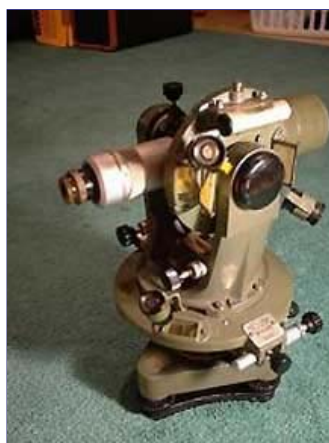
Left: Circa 1950, U.S. National Geodetic Survey technicians observing with a 0.2 arcsecond resolution Wild T-3 theodolite mounted on an observing stand. Photo was taken during an Arctic field party. Right: An optical theodolite, manufactured in the Soviet Union in 1958 and used for topographic surveying. ]

White Sands called in a radar specialist, a Mr. Eilar, from the West Coast to examine the radar scope pictures. Mr. Eilar told me there were 16,000 feet of radar scope pictures from various places around White Sands and that he had absolutely no explanation for what it was. But it was big and it was metallic.