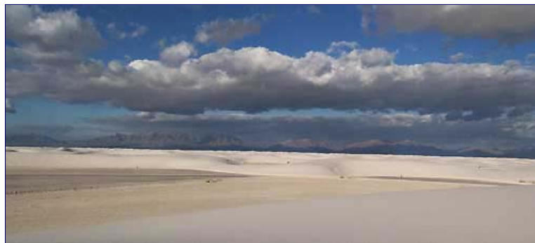
San Andres Mountains along western boundary of White Sands Missile Range. The white sands are gypsum sand in 275 square miles of desert and the world's largest gypsum dune field.

WHAT ABOUT THE 1955 WHITE SANDS EVENT WHEN THE VERY LARGE OBJECT LANDED THERE?