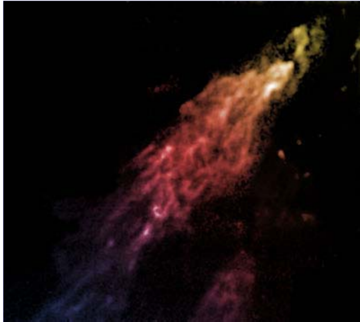
Actual image by Green Bank Telescope of Smith's Cloud, which is headed toward a collision with the Milky Way.