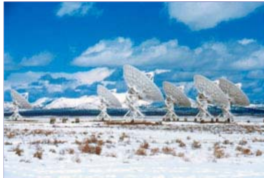
The Very Large Array (VLA) near Socorro, New Mexico.