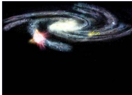
Artist's conception of Smith's Cloud approaching, then colliding with, our own Milky Way Galaxy in approximately 40 million years, a long way from our yellow sun.