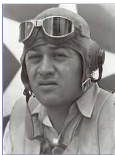
Gregory "Pappy" Boyington, Naval aviator with Marine Corps Reserve, 1937 to 1941. Left military to work for Central Aircraft Manufacturing Company (CAMCO) to build American fighter-bombers in Hangzhou, China.

He later commanded the famous U.S. Marine Corps squadron, VMF-214 ("The Black Sheep Squadron") during World War II. Boyington became a prisoner of war later in the war. For his U.S. Marine Corps service, he was awarded the Navy Cross and the Medal of Honor.]