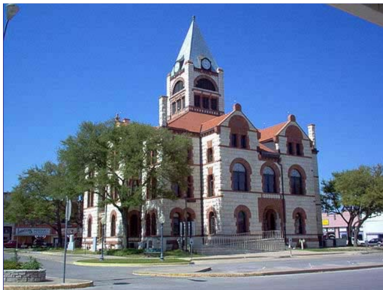
Erath County, Texas, was established January 25, 1856. The county seat is Stephenville and the Erath County Courthouse above was completed in 1893.