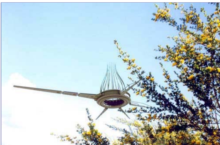
Another odd aerial "drone" photographed by "Chad" in Central California, on May 6, 2007. Photographer requested anonymity.