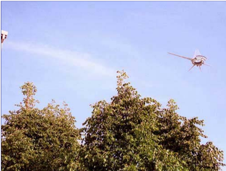
Rajman1977 Image 0013, taken with a Konica Minolta DiMAGE X on May 16, 2007, in Capitola, California.