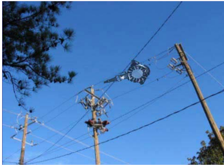
Odd, aerial object above power poles near construction site in May 2006, in Birmingham, Alabama.