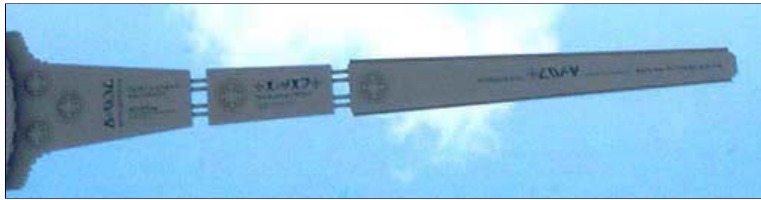
Letters, numbers and symbols on underneath side of drone tail photographed by "Chad" in Central California, on May 6, 2007.