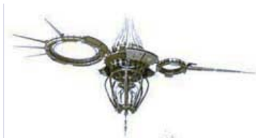
Left: Dragonfly-shaped “drone” near Bakersfield, California, May 6, 2007, © by “Chad.” Right: More complicated “drone” at Big Basin Redwoods State Park northwest of Santa Cruz, California, on June 5, 2007. Photograph © 2007 by “Ty B.”