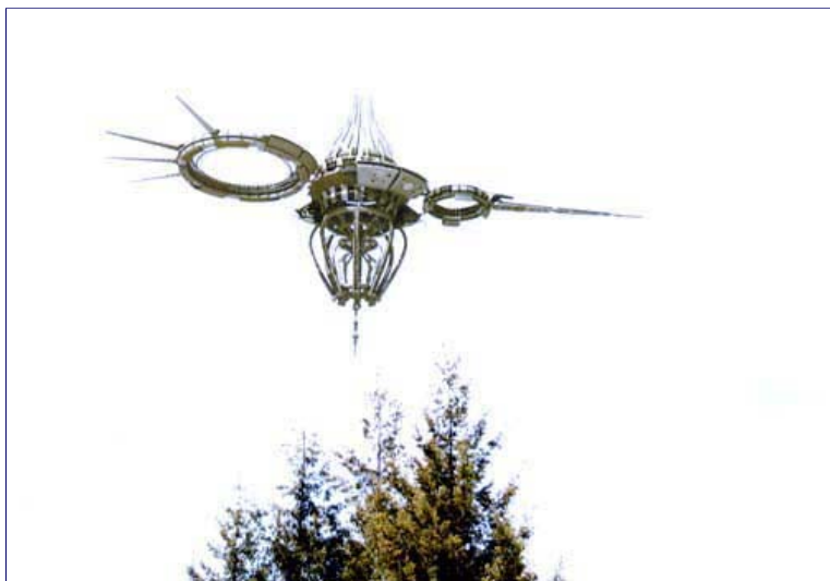
Above and below: two of a dozen photographs taken by "Ty B." while bicycling with a group in Big Basin Redwoods State Park northwest of Santa Cruz, California, on June 5, 2007. The aerial "drone" appeared three times, fading in and fading out rotating slowly and randomly clockwise and counterclockwise.