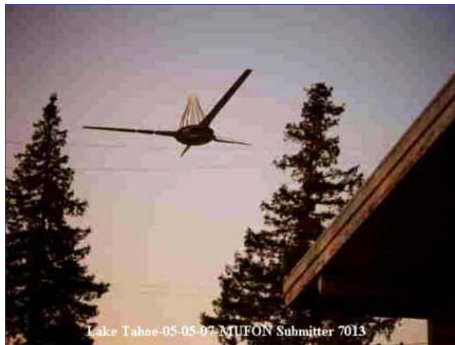
Odd aerial "drone" photographed in Lake Tahoe, California, on May 5, 2007. Photographer requested anonymity.