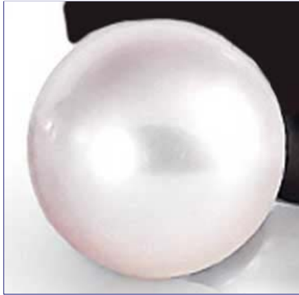
Spherical white pearl jewel.

sphere. It looked like the color of a diamond and a pearl – I mean, it was really bright, reflected light. Two guys were there looking like they were dusting on it or doing something.