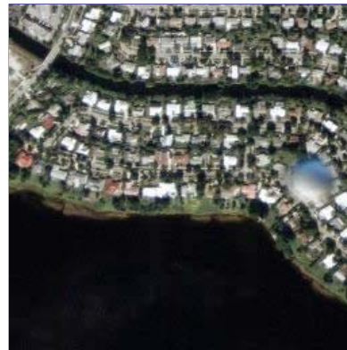
Mangonia Park, Florida, near Palm Beach. The coordinate of the "white pearl" in the photo is approximately: 26° 44' 57" N and 80° 04' 30" W.

"UFO over Mangonia Park, Florida. The Google Maps satellite map of Mangonia Park, Florida, shows a clear view of an unusual object floating above 39th Street in the town. The shadow on the object is similar to the shadows on the ground, meaning that it is in the atmosphere relatively close to the surface, probably no higher than 20,000 feet.